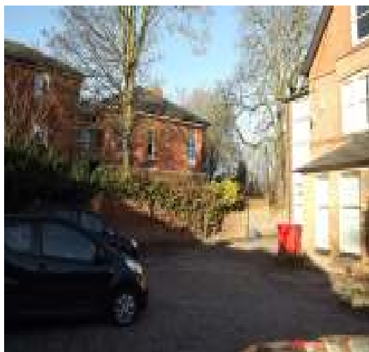
Front car park