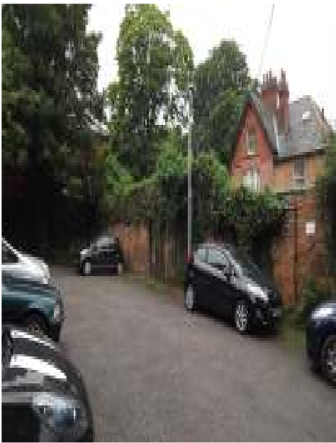
Rear car park