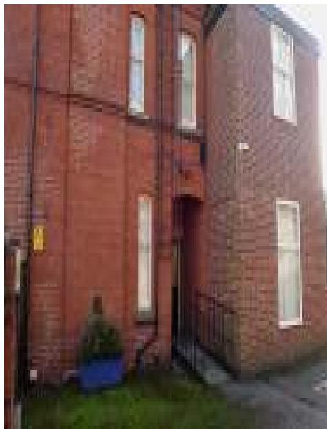
Side entrance through electric gates