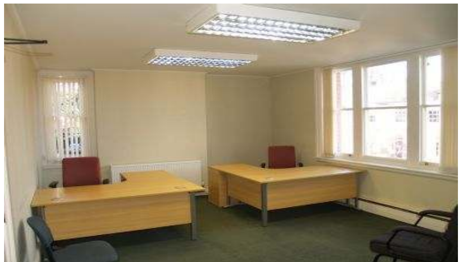
Internal photographs of an office suite