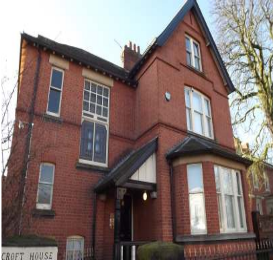
Front elevation from Ashbourne Road – automated wrought iron gates

Croft House, 51 Ashbourne Road, Derby, DE22 3FS