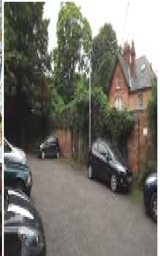
Additional car park at the rear